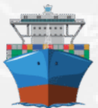
FOB-Free On Board