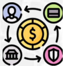
20% Advance & 80% Letter of Credit (LC)