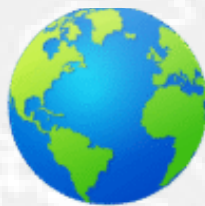
EXW – Ex- Works