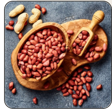
Peanut & Groundnut