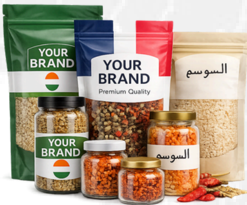
Private Label Facility