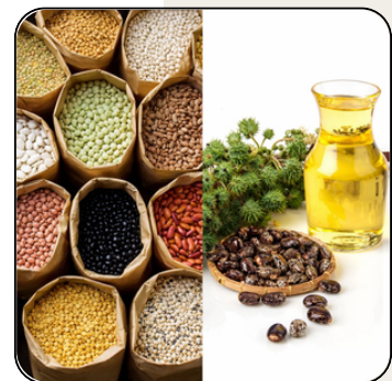
Beans & Castor

Bulk supply • Customized packing • Private labeling available