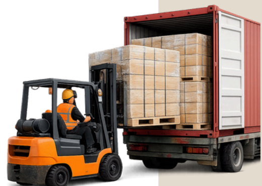
Palletizing & Container Stuffing