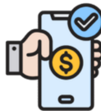
40% Advance & 60% on Document Against Payment (DP)