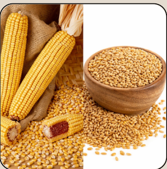
Corn & Wheat