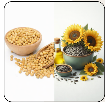
Soyabean & Sunflower