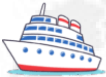
FAS-Free Alongside Ship