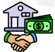
50% Advance & 50% Before Shipment Loading