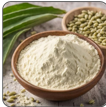
Guar Gum Powder