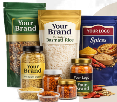
Custom Branding Options